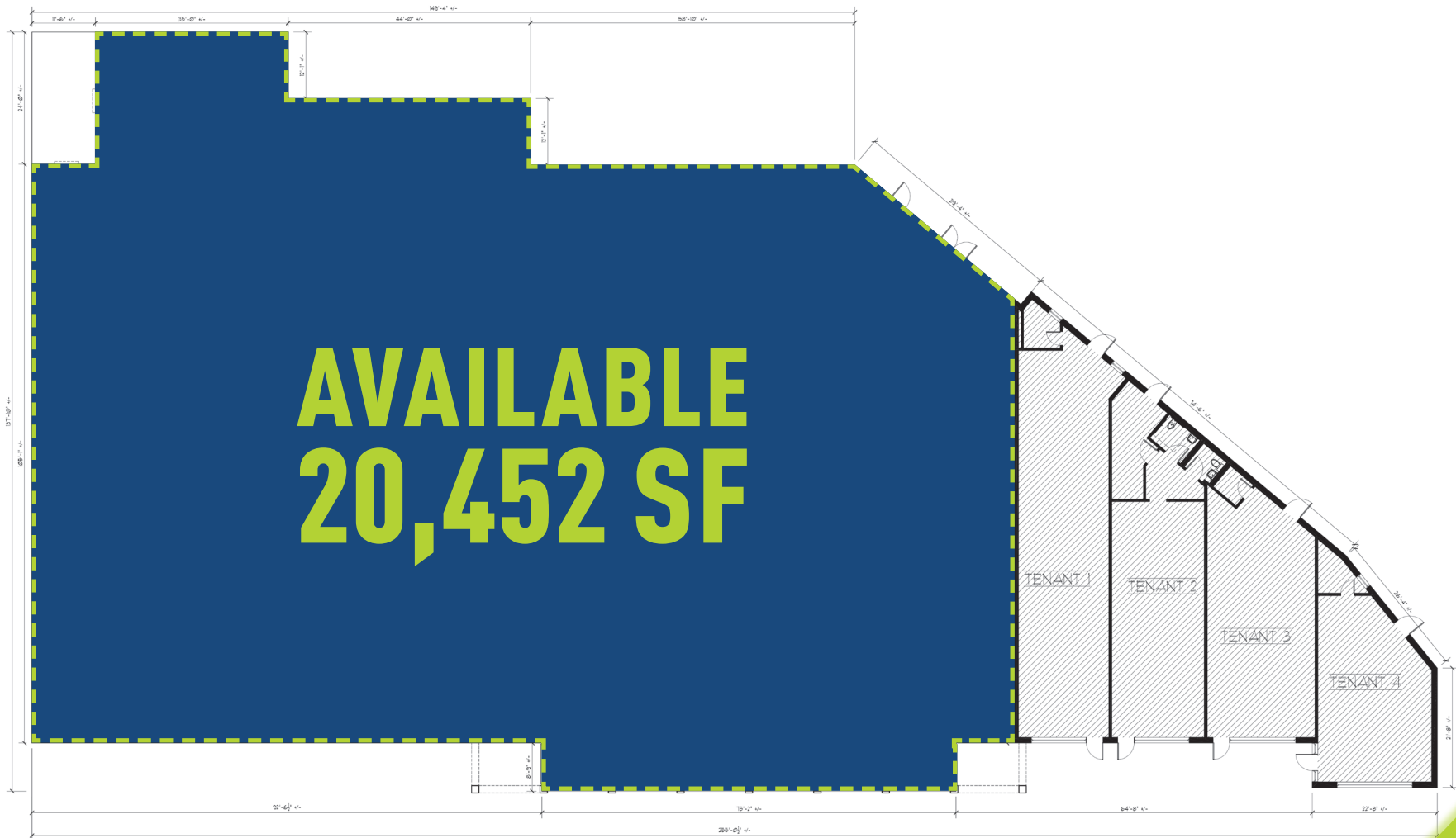
① FLOOR PLANS - EXISTING SCALE: 1/8"=1'-0"